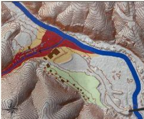
Geologic Hazard Map

Shasta County Office of Education (SCOE) and the National Park Service (NPS) are committed to re-opening of Whiskeytown Environmental School. Progress to date includes the completion of a geological safety study by NPS due to potential safety hazards. Fundraising efforts by the Redding Host Lions has paid for draft plans of the site rebuild in order to create a shared vision.